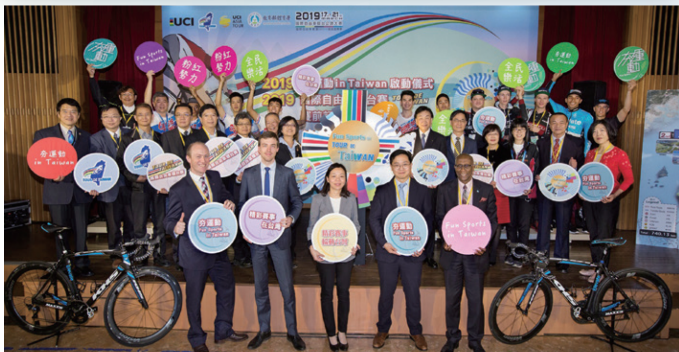
Group picture taken at the Fun Sports in Taiwan Launch Ceremony

The Fun Sports in Taiwan Launch Ceremony and Tour de Taiwan Pre-Tour Press Conference jointly organized by the Sports Administration, Ministry of Education, and the Chinese Taipei Cycling Association was held on March 15, 2019. Ambassadors and official representatives of foreign embassies and representative offices in Taiwan, representatives of Tour stages of the Tour de Taiwan, the Chinese Taipei cycling team and two teams of international elite riders, representatives of the organizers of the 100 sports events to be held in 2019, as well as enterprise sponsors, jointly opened the curtain on 2019 Fun Sports in Taiwan.