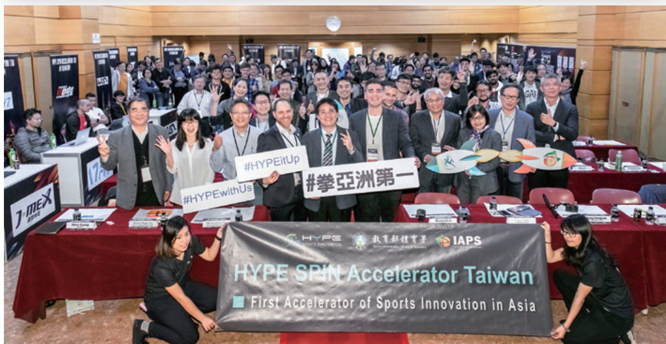
Group picture taken at the First Cycle Demo Day of SPIN Accelerator Taiwan