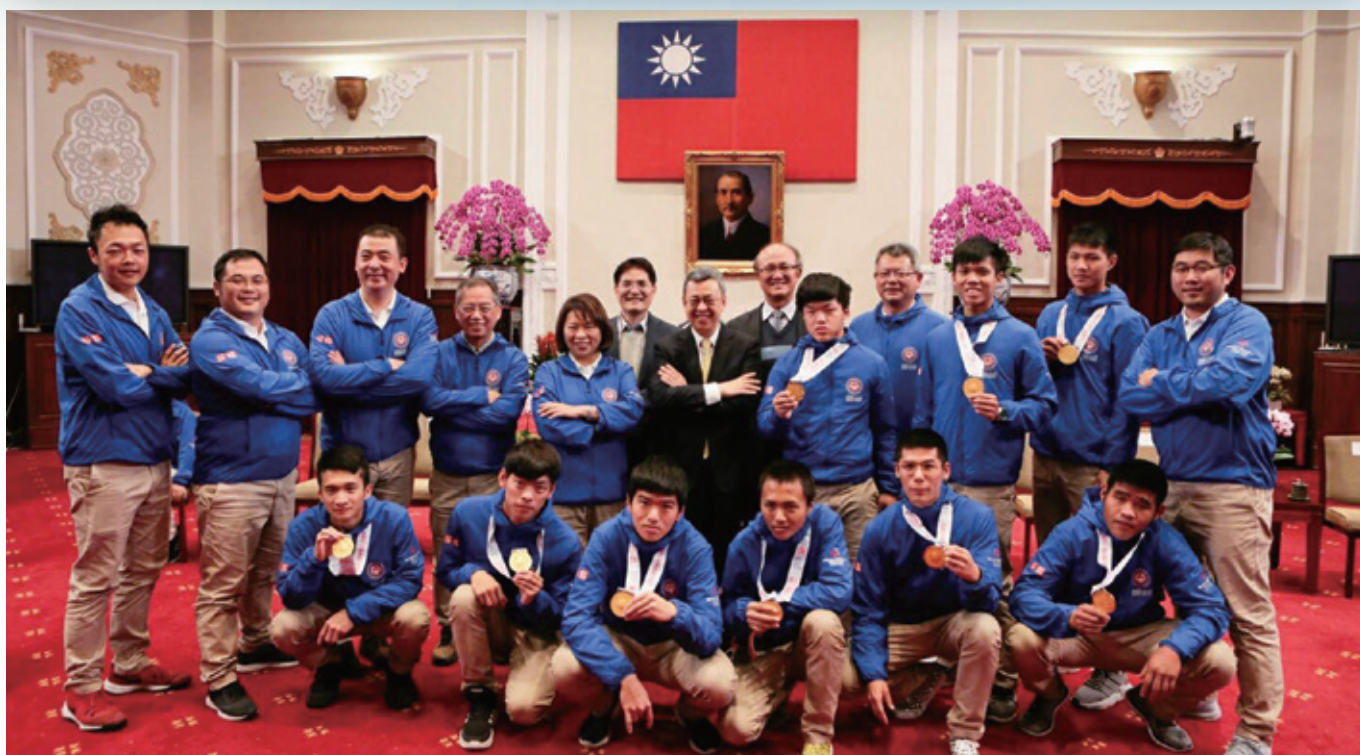
Vice President Chen pictured with the members of the Chinese Taipei Unified Basketball team who competed at the Special Olympics World Games Abu Dhabi 2019.

The Special Olympics World Games Abu Dhabi 2019 was held in Abu Dhabi and Dubai in the UAE during March 14-21. Our national delegation totaled 93 people, consisting of officials, coaches and athletes, 50 of whom were athletes who took part in eight sports, namely athletics, cycling, badminton, bowling, Unified Bocce, Unified Basketball, table tennis and roller skating. After days of intense competition, our national team won 23 gold, 21 silver and 9 bronze, a total of 53 medals. The national team landed on home soil on the evening of March 23 and were received by Vice President Chen Chien-jen on the morning of March 24. Vice President Chen hopes that the athletes will continue to pursue their life dreams after the Games. Furthermore, he not only encouraged more physically and mentally challenged people to go outdoors and engage in sports, partake in self-challenge and building a network