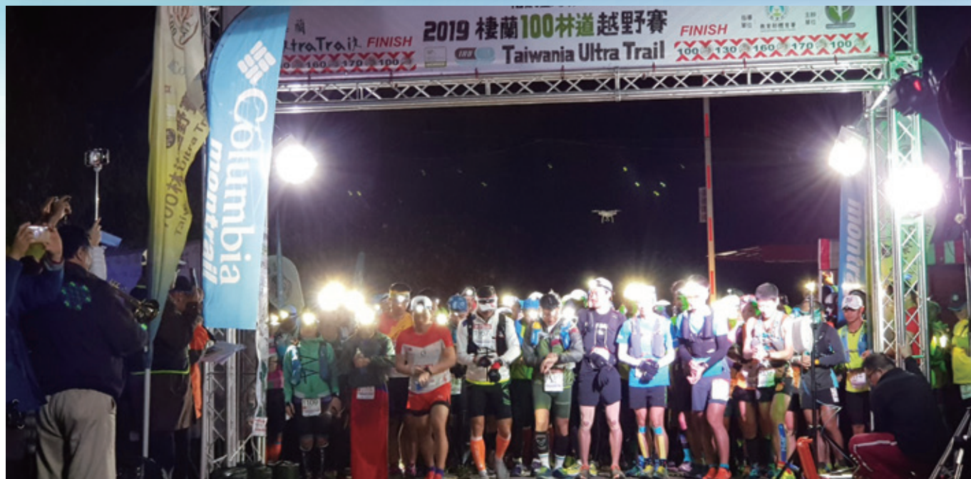
2019 Taiwania Ultra Trail

The inaugural edition of the Taiwania Ultra Trail was held in 2018 at Qilan, Yilan County, successfully sparking a fashion for trail running in Taiwan and showcasing a Taiwan-brand event on the international stage. The course is unique because it passes through the natural hidden wonderland, Qilan, with the iconic 74-meter-tall Taiwanias known as the "Three Sisters" along the way. 2019 Taiwania Ultra Trail effectively raised the visibility of sports in Taiwan and presented a positive image to the world. Approximately 800 runners from 11 countries participated in this event, including Japan, USA, Singapore, UK and Vietnam. The runners were lined up to start on Qilan No. 100 Forest Road at 5am on March 2. The route mainly followed No. 100 Forest Road; taking into account the sensitive nature of the pristine natural setting in which the event was held, priority was given to protecting the natural environment and the runners were required to follow the race rules set by the organizers to follow the principles of leave no trace and environment protection. The Sports Administration stated that this event was successfully held due to the efforts of the organizing unit and hoped that all runners to look forward to the 2020 Taiwania Ultra Trail for the opportunity to showcase Taiwan's beauty and the enthusiasm for sport of its people to the world again.